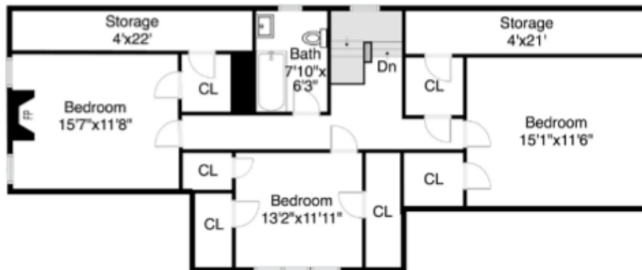
Third Floor Plan